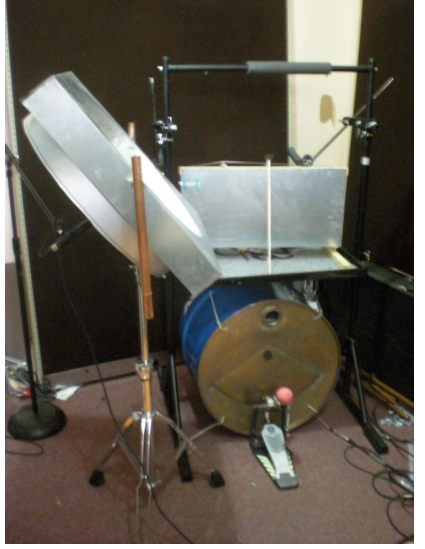
Fig. 3 Bowed Spring Pan Kit

The pulse forms generated in the sentics cycle exercise do not lend themselves as easily to creative rhythmic expression and perhaps are not meant to. In order to bring out the rhythmic potential of the essentic forms of the pulse through the bowstick I incorporated it into a novel drum kit design (Fig. 3). This kit was composed of a spring for the bowstick played with the right hand, a steel pan drum encased in sheet metal played with the left hand, and an oil drum for the kick drum. I choose this combination of drums for their compatibility of metallic sounds.